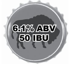
Extra Special Bitter