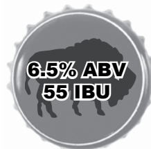
India Brown Ale