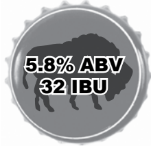
Vanilla Brown Ale