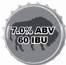
Kettle Black IPA