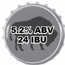
Belgian Pale Ale