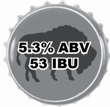
American Pale Ale

Please check with your server for current availability of fresh brewed beers.